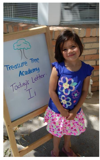
Afternoon Preschool (Aug)