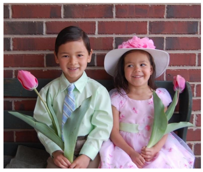
Easter Sunday (April)