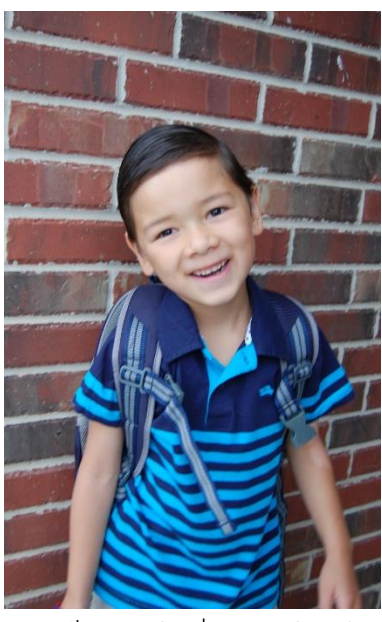
1<sup>st</sup> Day of 2<sup>nd</sup> Grade (Aug)