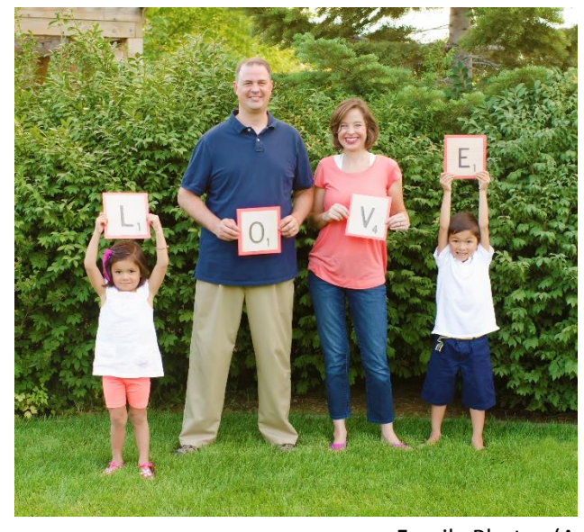
Family Photos (August)